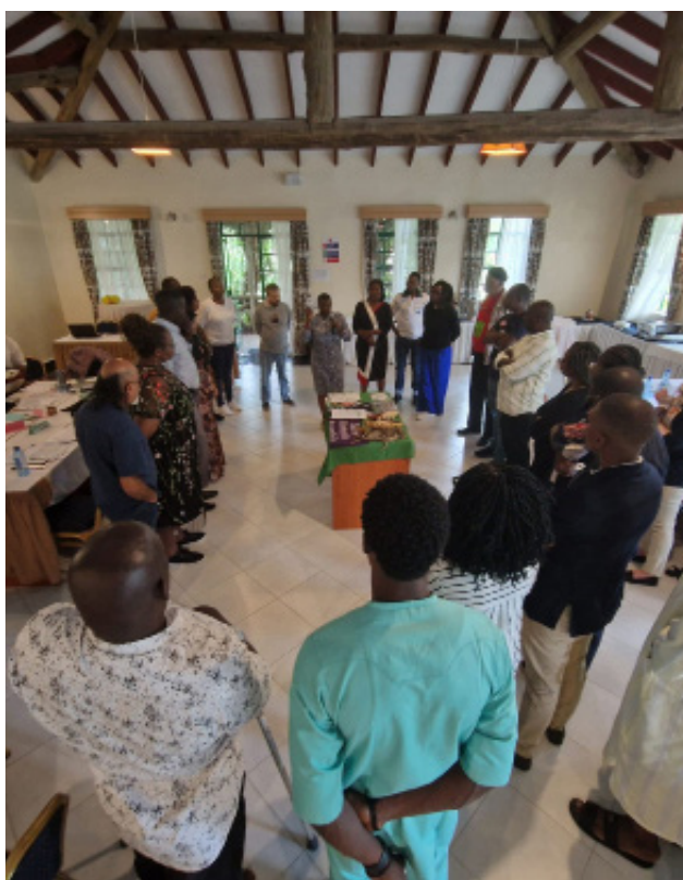
Photo: Group work at the KNRG Gathering in Kenya, 2024.

Another change that was noted was second layer of leadership emerging within several movements, promoting sustainability and resilience within the movements.