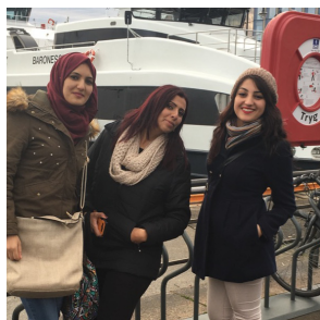
REPRESENTATIVES FROM JOINT ADVOCACY INITIATIVE (JAI) IN PALESTINE TELL THE STORIES OF YOUNG PEOPLE LIVING UNDER OCCUPATION DURING AN EXCHANGE IN NORWAY WITH RØNNINGEN FOLK HIGH SCHOOL.

Support for youth exchange, training, and advocacy.