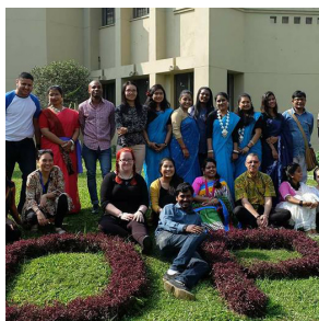
PARTICIPANTS OF THE WSCF'S TRAINING ON MIGRATION AND HUMAN RIGHT HELD IN BANGLADESH.

For these networks, there is a deep need for spaces for migrants to characterize their plight, analyze their situation, and identify forms of accompaniment and advocacy that are relevant and most effective in dealing with migration. They continue to struggle so that no policy is being set without the voices of the migrants themselves present. They continue to relay the countless struggles of migrants and refugees on the ground, so that their rights, welfare and dignity are upheld. As they have continued to say that the negotiation table is never too small when discussing the lives and the dignity of grassroots communities that are forced to leave their homes. ■