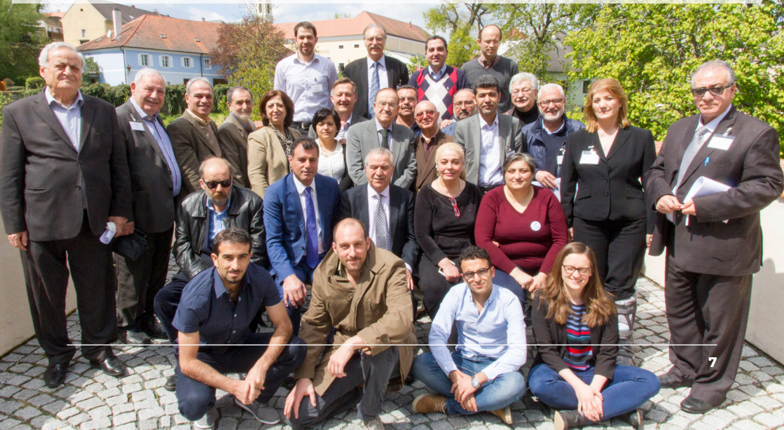
PHOTO: PARTICIPANTS OF THE "CONFERENCE ON THE PRINCIPLES OF A FUTURE SYRIAN CONSTITUTION" HELD OUTSIDE OF VIENNA. TWENTY-EIGHT SYRIAN PARTICIPANTS (LEADERS OF ETHNIC MINORITY GROUPS, EXPERTS IN LAW, ISLAMIC SHEIKS, REPRESENTATIVES OF WOMEN'S ORGANIZATIONS, AND RENOWNED POLITICIANS FROM THE OPPOSITION) MET TO DISCUSS THE QUESTION OF SYRIA'S FUTURE AFTER YEARS OF VIOLENCE AND CIVIL WAR.

Support towards network building and exchanges of "frontline" grassroots movements that are fighting against the extractive industries.