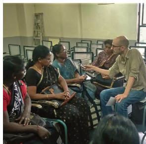
BILATERALS.ORG INTERVIEWING DALIT WOMEN IN INDIA WHO MOBILISED AGAINST THE PROPOSED FREE TRADE AGREEMENT RCEP.