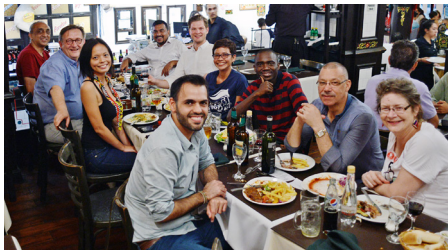
Photo: Dinner with several of Karibu's partners, Buenos Aires 2017.

One of the main targets from the UN Sustainable Development Goals is to reduce inequality within and among countries. However, this goal is far from being reached. In January 2017 we learned that eight men owned the same wealth as half of the world's population. Going into a new year we do so with the realization that the inequality between the richest 1% and the rest is huge – and growing.