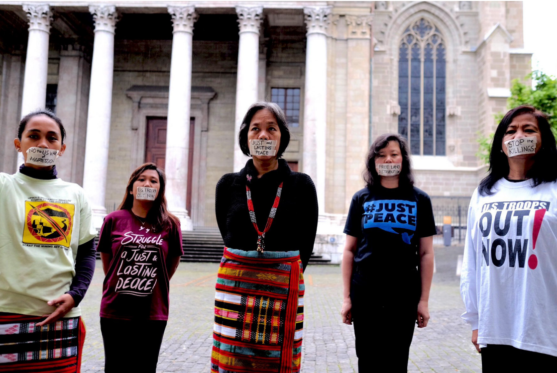
PHOTO: IN MAY, THE ‘PHILIPPINE UPR WATCH’ ARRANGED A DEMONSTRATION AT THE GENEVA OLD TOWN WITH CALLS FOR “NO TO US WARS OF AGGRESSION”, “US TROOPS OUT NOW”, “JUST AND LASTING PEACE”, “FREE LAND DISTRIBUTION”, AND TO “STOP THE KILLINGS”. THE ACTION DEPICTS THE CRIES OF THE FILIPINO PEOPLE THAT ITS GOVERNMENT CONTINUES TO IGNORE.