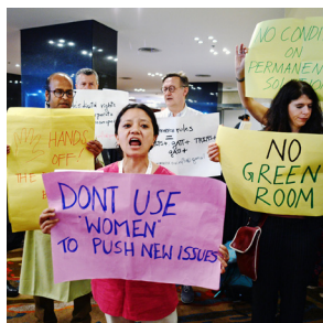
IN DECEMBER, MEMBERS FROM THE OWINFS-NETWORK ARRANGED AN ACTION-PROTEST OUTSIDE THE WTO MINISTERIAL CONFERENCE'S MEETING HALL. ONE OF THE TOPICS IN FOCUS WAS A FULL STOP ON NEW ISSUES INTO THE WTO-NEGOTIATIONS.