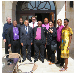
DELEGATIONS FROM THE SOUTH AFRICAN COUNCIL OF CHURCHES' SOLIDARITY PILGRIMAGE TO PALESTINE IN JUNE.

Support for Global South participation at IHMs international reconciliation conference.