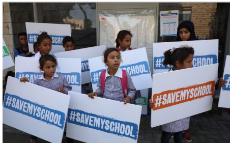
PHOTO: A GROUP OF 18 BEDOUIN SCHOOLCHILDREN FROM THE VILLAGE OF AL KHAN AL AHMAR DEMONSTRATE OUTSIDE THE JERUSALEM RESIDENCE OF THE ISRAELI PRESIDENT DURING A MEETING WITH GERMAN CHANCELLOR ANGELA MERKEL. JAHALIN SOLIDARITY ORGANIZED THE DEMONSTRATION.

Of the many victories (big and small) in the last period, one resounding victory came from the town of Cajamarca in Colombia. There, the local community passed a referendum in a landslide vote to ban all mining projects in the area. The referendum negates plans by AngloGold Ashanti, one of the world's largest mining company, for the "La Colosa" open-pit gold mine. Resistance to the project was aided by Yes to Life, No to Mining , a movement that builds networks of communities against destructive mining operations. Their mobilization efforts proved vital to galvanizing such a powerful community response to the threat of Anglo-Gold. Similar referendums began occurring across the country in 2018.