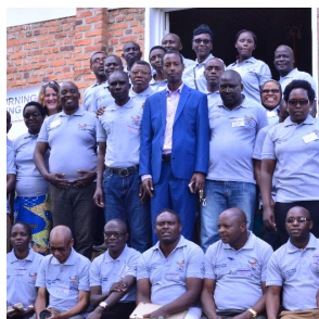
PARTICIPANTS OF EEAR'S NONVIOLENCE TRAININGS TAKE A GROUP PHOTO FOLLOWING THE 3-DAY TRAINING THAT TOOK PLACE IN KIGALI, RWANDA.

Support towards strategic workshop on Kairos Palestine advocacy.