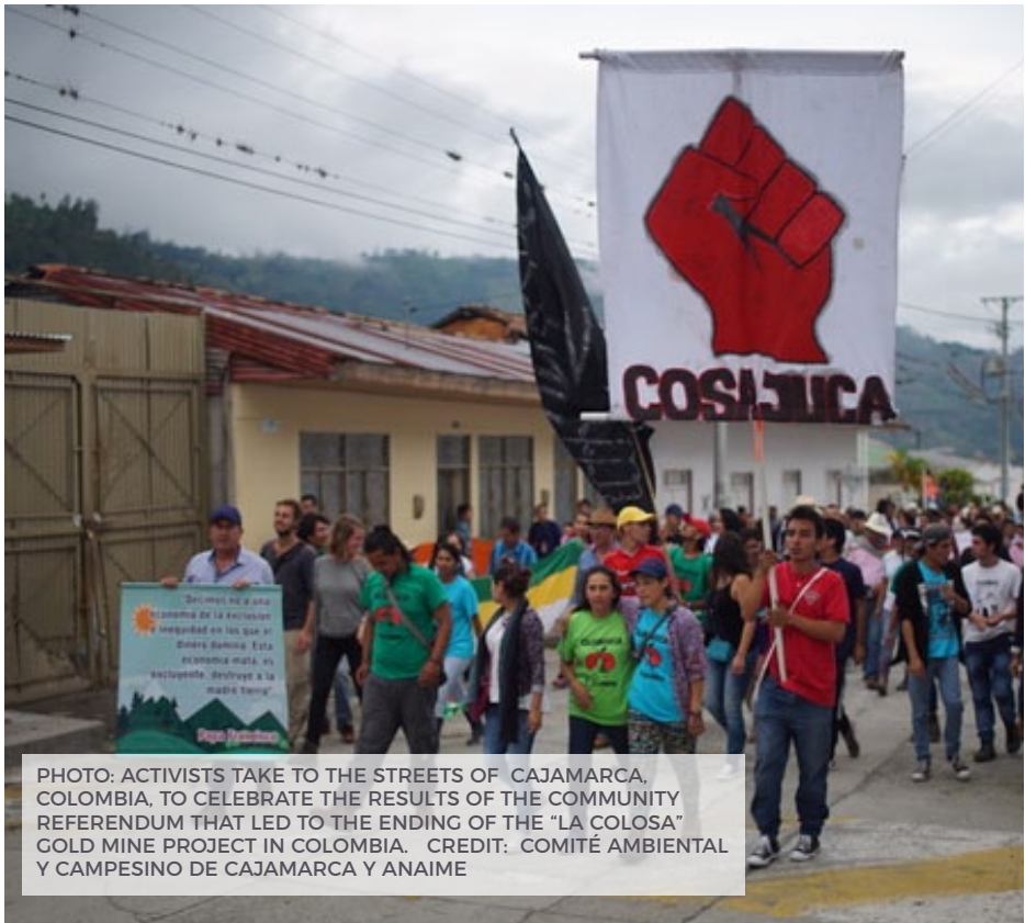
PHOTO: ACTIVISTS TAKE TO THE STREETS OF CAJAMARCA, COLOMBIA, TO CELEBRATE THE RESULTS OF THE COMMUNITY REFERENDUM THAT LED TO THE ENDING OF THE “LA COLOSA” GOLD MINE PROJECT IN COLOMBIA.